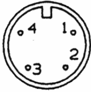
PIN VIEW NC4FX